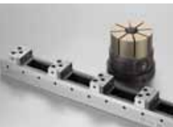
SINGLE AND MULTIPLE CLAMPING SYSTEMS