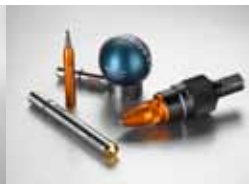
MARKING AND CLEANING TOOLS