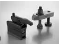
STANDARD CLAMPING ELEMENTS