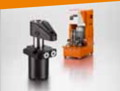
HYDRAULIC CLAMPING SYSTEMS