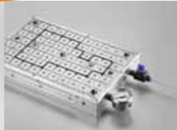
VACUUM CLAMPING SYSTEMS