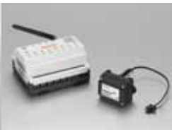
WIRELESS SENSING SYSTEMS